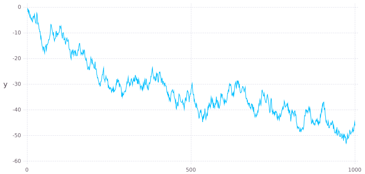
Figure 1: A random walk.