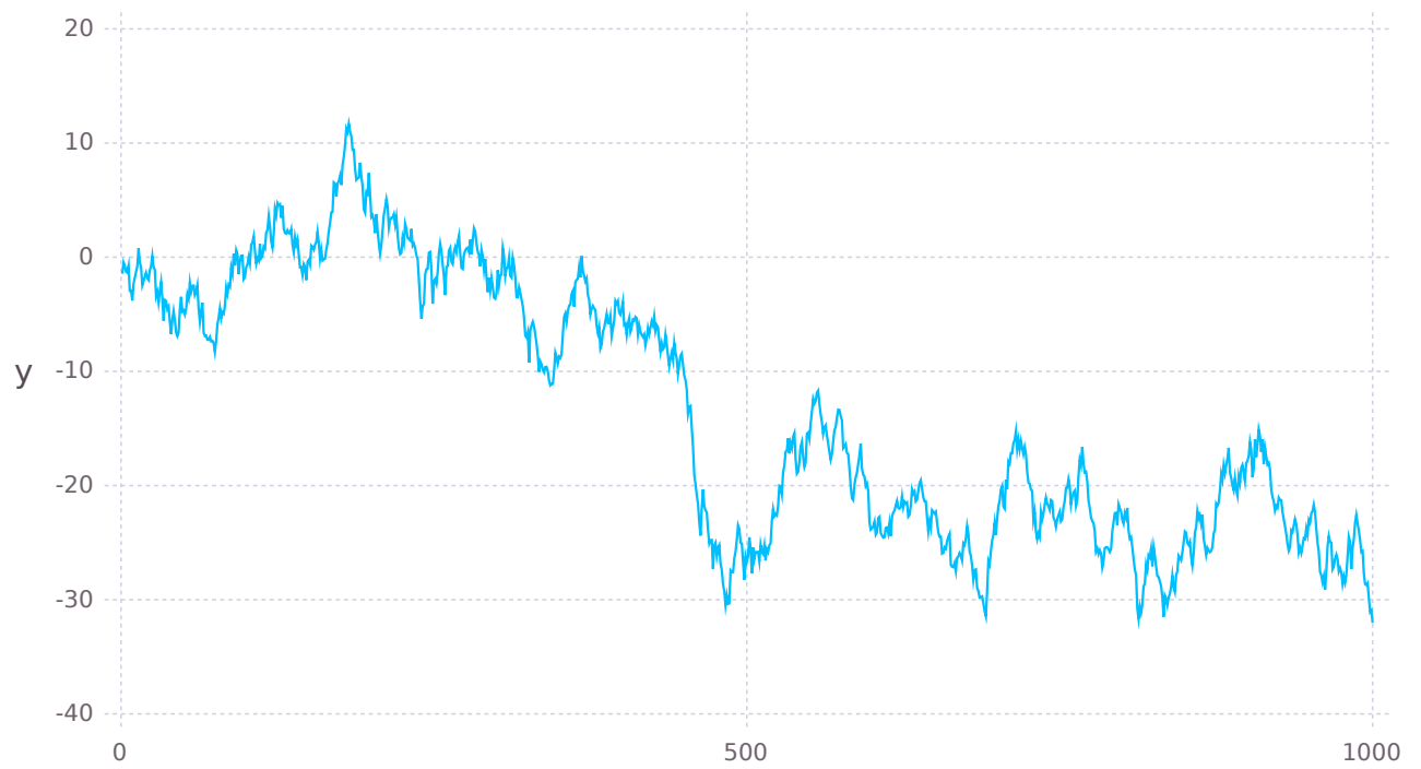
Figure 1: A random walk.